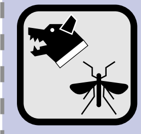
Animals and insects bites