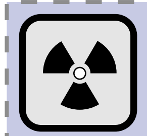
Industrial, nuclear, biological hazards